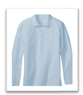
Long sleeve polo